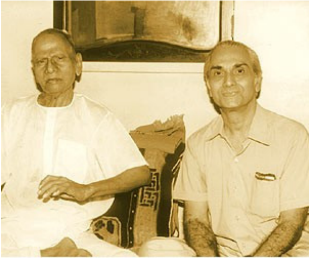
Nisargadatta (L) with Ramesh Balsekar (R)