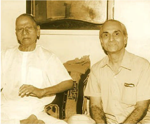
Nisargadatta (L) with Ramesh Balsekar (R)